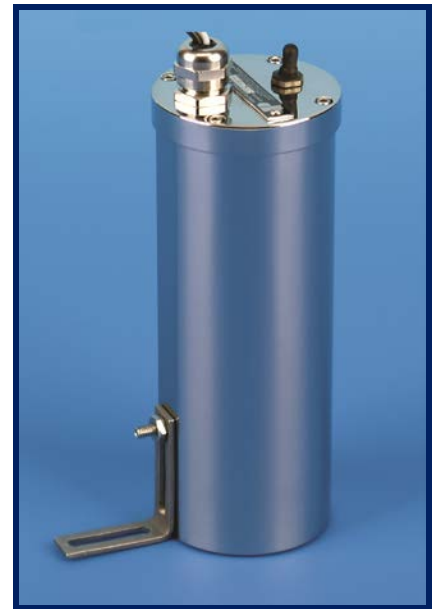
PAPAILIAS, Inc. Series MSL Non-Hazardous Area Sight Glass Light