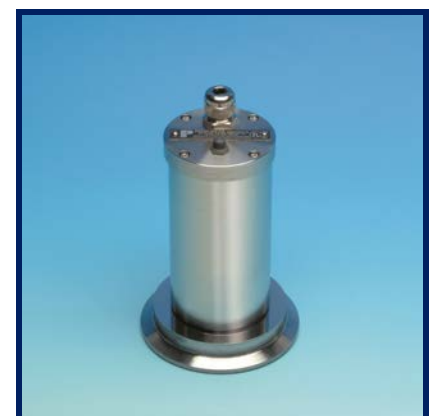
PAPAILIAS, Inc. Series MSL/SVTC Clamp Type Sanitary Light Glass