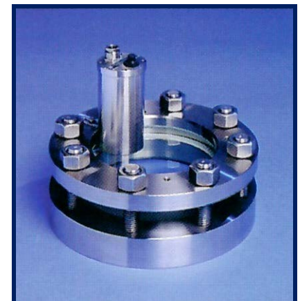
PAPAILIAS, Inc. Series MSL/NW Weld Pad Type Combination Sight/Light Glass